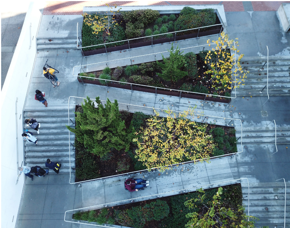
A view of the sproul staircase from above.

Stay on top of academic and financial deadlines through the Office of the Registrar , which puts out a Student Enrollment and Deadline Calendar each school year. DSP students, check in with your Disability Specialist for additional information on accommodations.