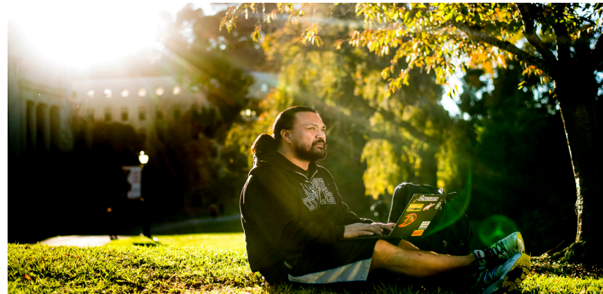
A student hanging out on campus.