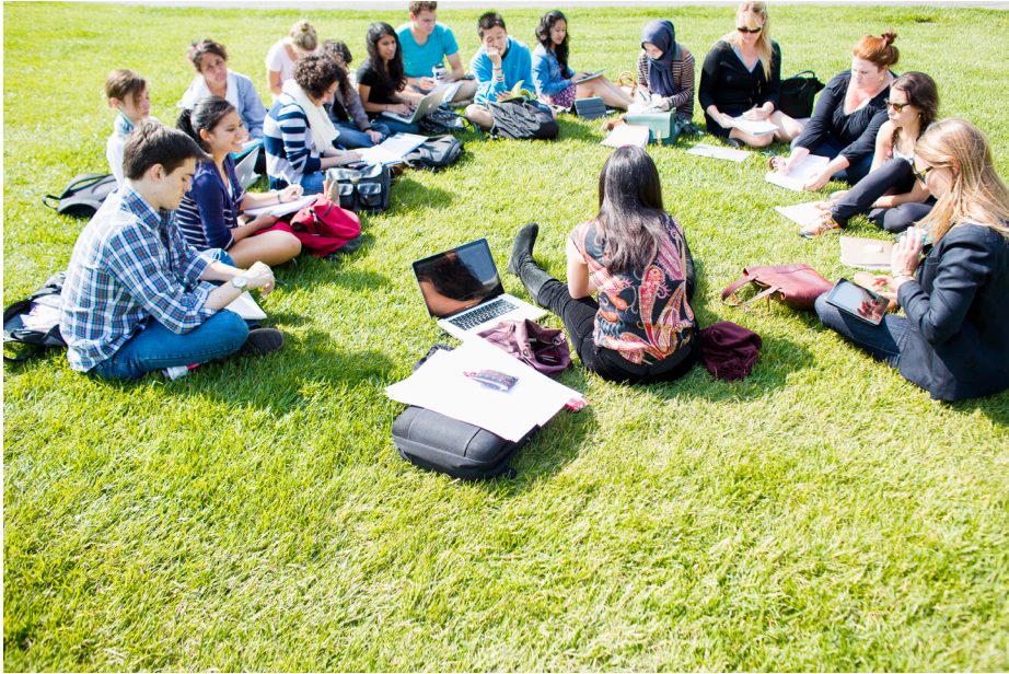
Students enjoying a lecture outside on the grass.