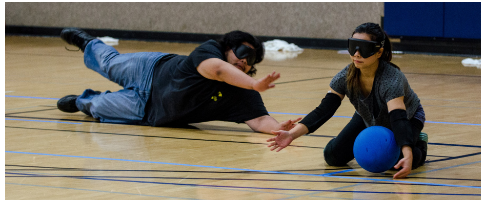
Students playing Goal Ball at the RSF.

Contact Inclusive Recreation, for more information ( inclusive.rec@berkeley.edu ).