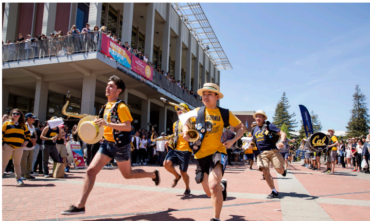
Cal’s band members running to start their set.

Use a Clipper Card to pay for transportation fare. You can load your card at BART stations or online. Riders under age 65 with disabilities can apply for a Regional Transportation Connection (RTC) Clipper card. It automatically calculates discounts and works like any other Clipper card.