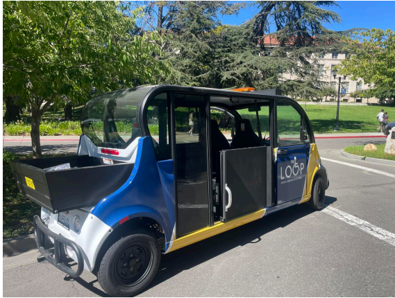
The Loop cart.