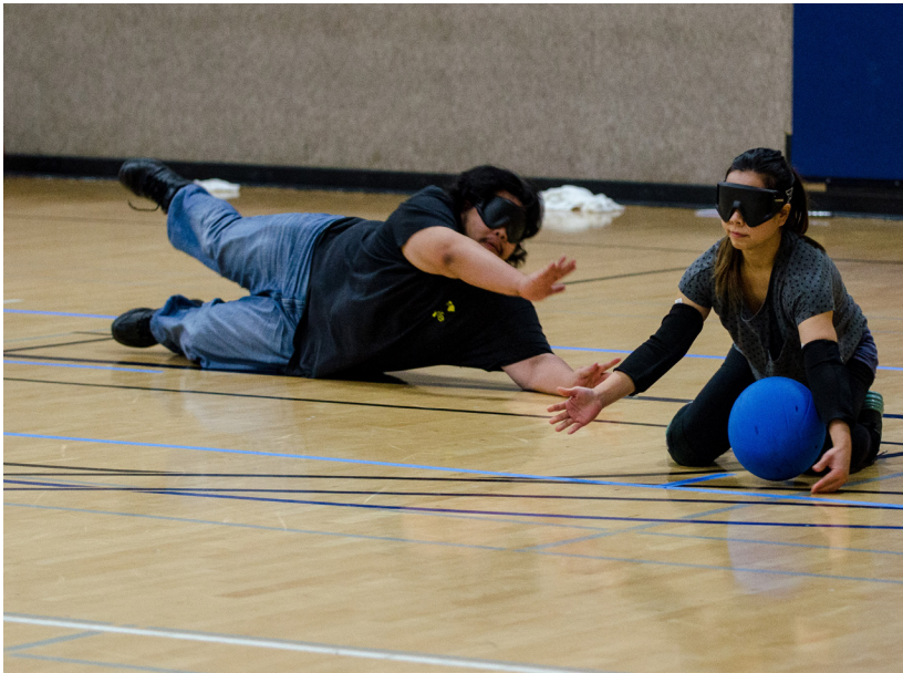
Students playing Goal Ball at the RSF.

Contact Inclusive Recreation, for more information ( inclusive.rec@berkeley.edu ).