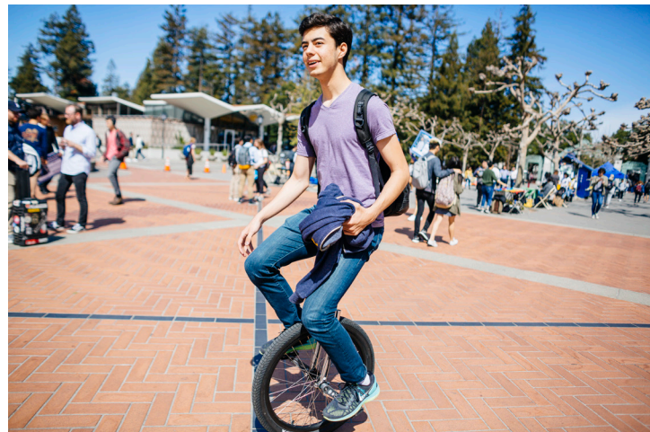
Student riding a unicycle on upper sproul.