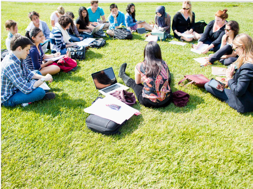
Students enjoying a lecture outside on the grass.

Medical care is conveniently located across the street from campus at the Tang Center . UHS offers a Care Manager for DSP students to help coordinate care through Tang. Contact: (510) 664-9926. Transportation and additional resources provided on the UHS website .