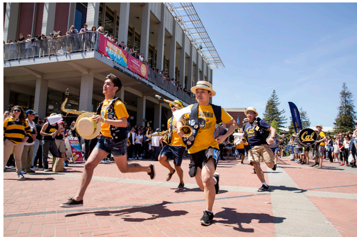
Cal’s band members running to start their set.

Use a Clipper Card to pay for transportation fare. You can load your card at BART stations or online. Riders under age 65 with disabilities can apply for a Regional Transportation Connection (RTC) Clipper card. It automatically calculates discounts and works like any other Clipper card.