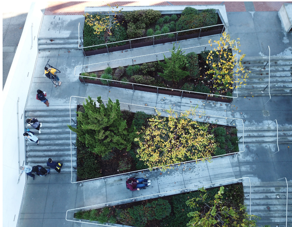
A view of the sproul staircase from above.