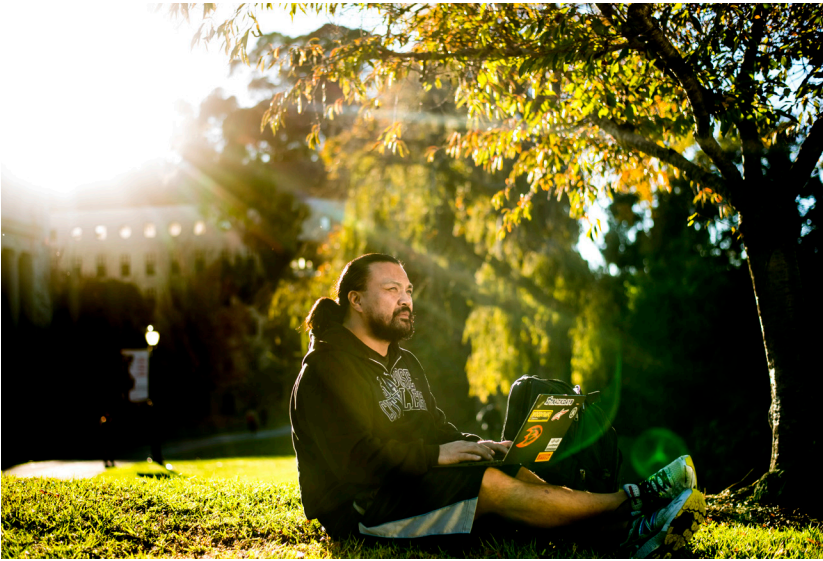
A student hanging out on campus.

The Associated Students of the University of California (ASUC) , is the officially recognized student association at Cal. Check out existing student organizations or start your own!