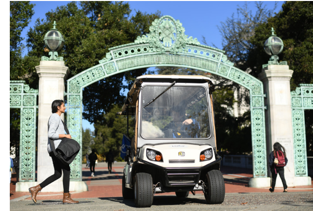
A student using the Loop service.

Maximino Martinez Commons, is a secure, socially dynamic community building combining residence hall rooms and apartments.